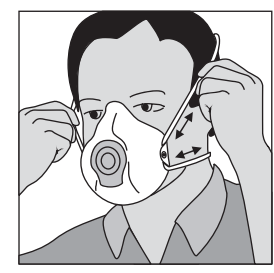
4. Adjust strap by pulling loop on strap.