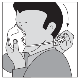
Place respirator on chin and pull loop over head tight to the neck.