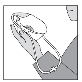
1. Pull strap to form a large loop.